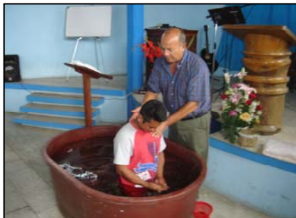
Baptism at the Church of Pinotepa

As we come into the Christmas season we remember the time when our Saviour came to earth. Jesus came that we might be reconciled to God. He left us with this message: I am coming back. These lingering words of Jesus remind us that at any moment the Lord will return. Are you ready? Will we be found at work anticipating this coming day? Or will we be found thinking the