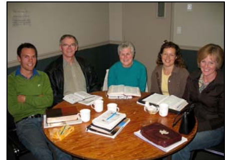
Discipleship group at Ross Road Community Church in Abbotsford

Through this time of learning God has shown me that He uses ordinary people to join with Him in His work. Oh that we would be a people whose desire is to help others in their walk with Christ. Walking beside them so they don't have to go alone. Investing our lives into others who are establishing their relationship with Jesus and serving Him. The Bible says, "And let us consider how we may spur one another on toward love and good deeds, let us not give up meeting together as some are in the habit of doing but let us encourage one another and all the more as you see the day approaching" (Heb 10:24-25).