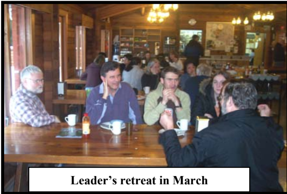
Leader's retreat in March

It has been awhile since I corresponded with you as I have been like a fish out of water as we patiently wait for our home to be completed after the fire last August. Despite this God has been expanding Discipleship International in new and exciting ways. Please enjoy as I share some of the highlights of the ministry this year.