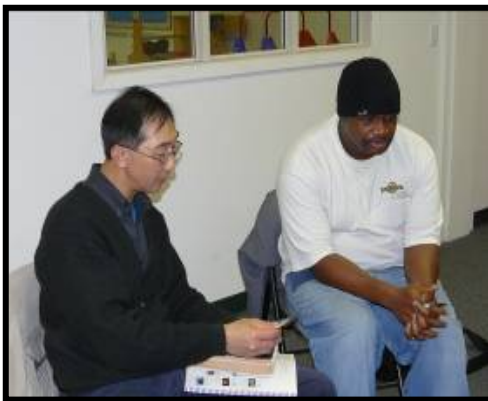
Reviewing scripture memory

I am taking on an expanded role within DI as the provincial director so that our current director can have more time to start-up new works across Canada. This means giving more direction, vision and support to the team here in B.C., planning and organizing events and learning more of the daily operations of running the organization. This will be a big challenge and a lot more responsibility but I know I serve a big God. The advantage of being in a smaller organization is that I will still be hands-on by leading groups and discipling those that God brings into my life.