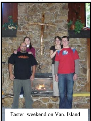
Easter weekend on Van. Island

I am learning a lot about the administrative side of running a ministry as I ease into the role of Provincial Director. Seeing all the behind the scenes work is eye opening. Part of the role is also learning how to disciple leader's. As we were discussing at our last staff meeting, leading leader's is another whole learning curve from leading the discipleship classes.