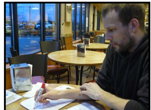
Sharing the Bridge diagram at Tim Horton's