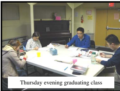
Thursday evening graduating class